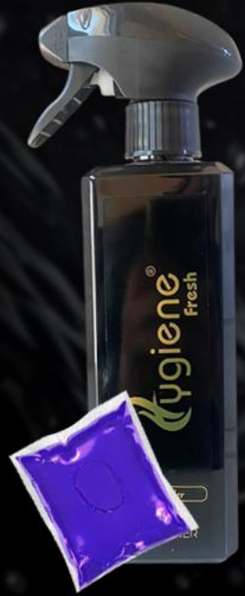
Air Freshner & Eliminator Lavender Conc