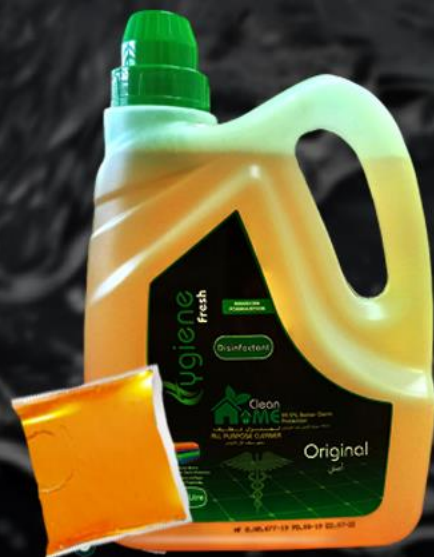
All Purpose Cleaner 2024 Conc