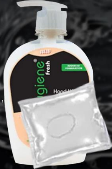
Foaming Hand Soap Rain Scent Conc