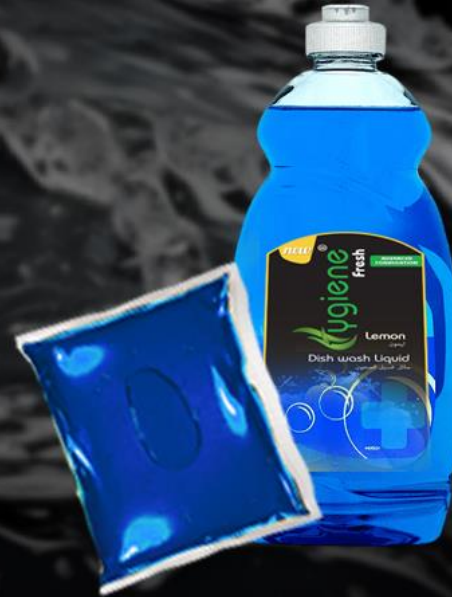
MANUAL Dishwashing Detergent Conc