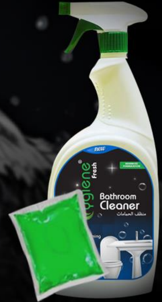
Non-Acid Bathroom Cleaner Concentrate