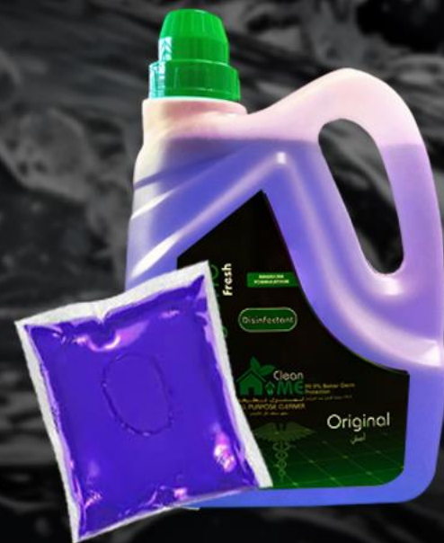
Heavy Duty Floor Cleaner Concentrate