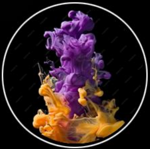
Entire Pack Dissolves Easily in Water