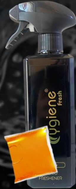
Air Freshner & Elimi- nator Wildberry Conc