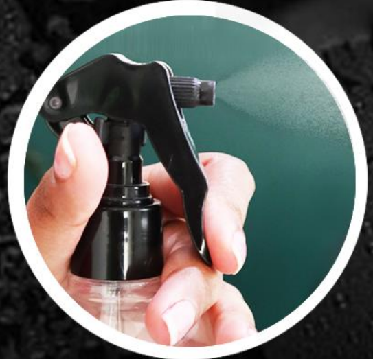
Shake & Use