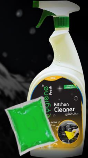
Kitchen Cleaner Conc