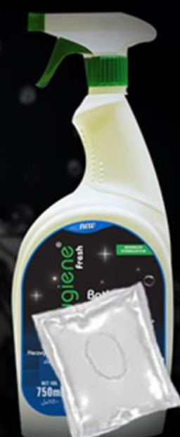
Sanitary Restroom Cleaner & Deodorizer Conc