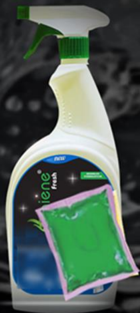
Tile & Grout Cleaner