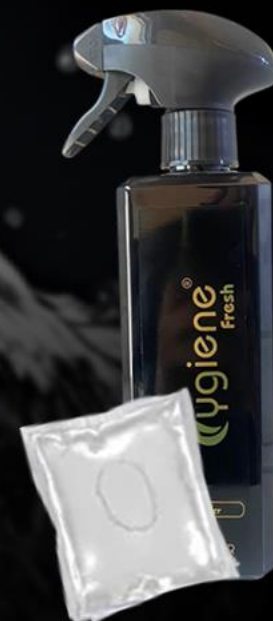
Air Freshener & Eliminator Fresh Scent