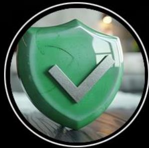
Safe and Easy to Use