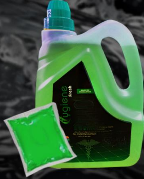
Car & Truck Wash & Sheet Conc