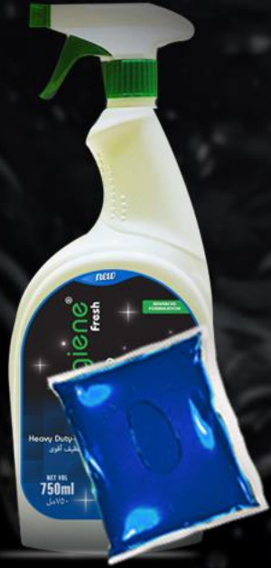
Waterless Vehicle Wash Conc