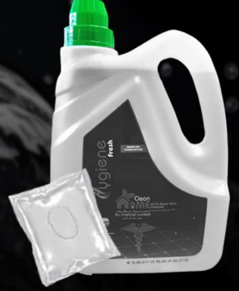
Bug Remove Concentrate