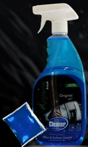
Glass & Hard Surface Cleaner Conc