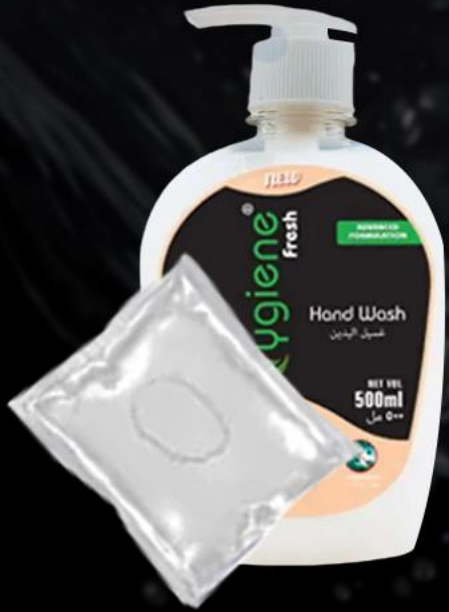
Foaming Hand Soap White Tea Scent Conc