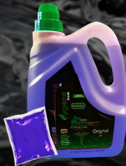
All Purpose Cleaner 2024 Conc