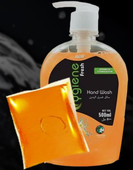
Foaming Hand Soap White Tea Scent