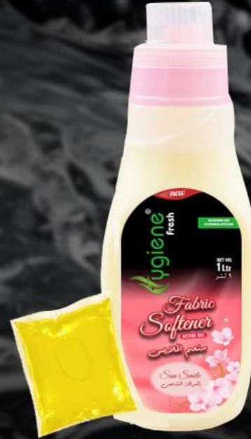
Carpet & Fabric Stain Remover