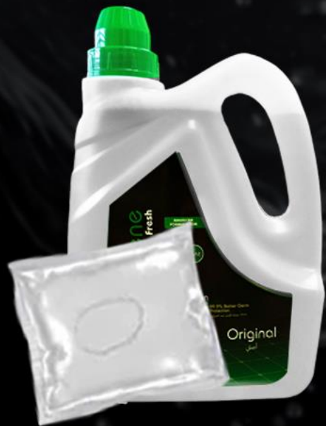
Floor Conditioner & Neutralizer Concentrate