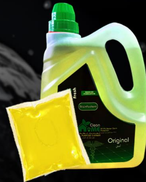
Citrus Floor Cleaner