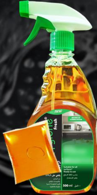
Disinfectant EPA Reg 1839-176 Brown