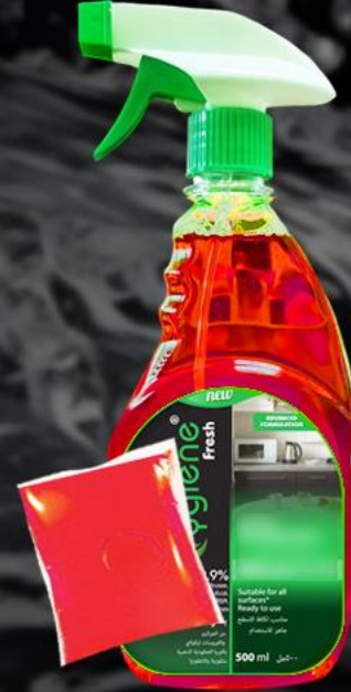
Disinfectant EPA Reg 1839-176 Red