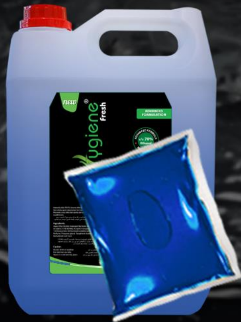
Holding Tank Treatment Conc